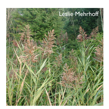
*Invasive phragmites Phragmites australis