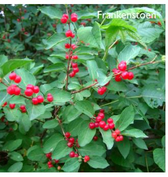
Invasive honeysuckles Many, Lonicera spp.