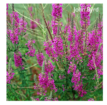
*Purple loosestrife Lythrum saliaria