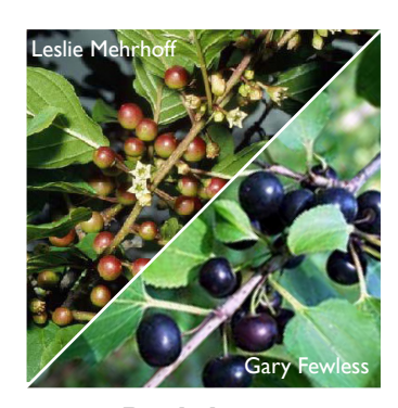
Buckthorn, glossy and common Frangula alnus Rhamnus cathartica