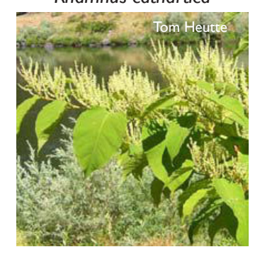
*Knotweeds - Japanese, giant, and bohemian Reynoutria japonica, R. sachalinensis, R. x bohemica