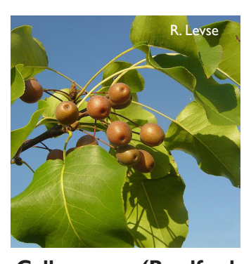
Callery pear (Bradford and Cleveland) Pyrus calleryana varieties