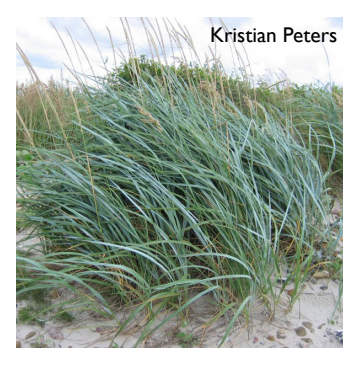
Blue lyme grass Leymus arenarius