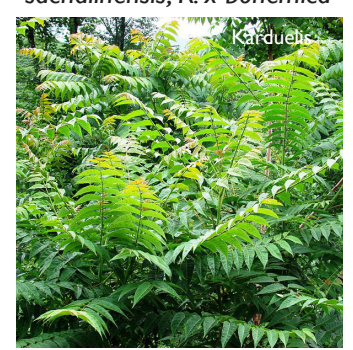
Tree-of-Heaven Ailanthus altissima