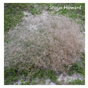
Baby's Breath Gypsophila paniculata

Those with an * by their name are illegal to move, trade, sell, or share in Michigan.