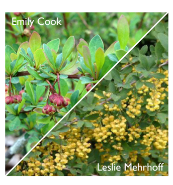
Barberry, Japanese and common Berberis thunbergii Berberis vulgaris